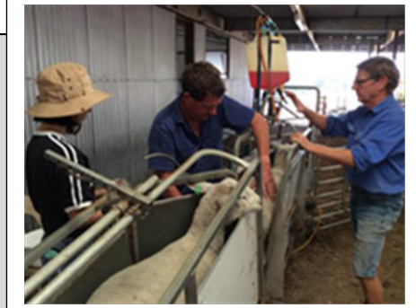
Collecting individual faecal samples to determine genetic resistance to worms.

We will continue to collect faecal samples for individual worm analysis in order to improve the accuracy of the worm resistance ASBV (PFEC). Any outside sires we use in our AI or ET programs are all strongly or highly resistant to internal parasites.