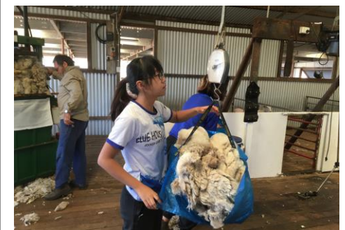
Weighing Maternal ram fleeces for analysis and wool testing.

Our main emphasis, however, continues to be on the provision of high, early-growth genetics for maximum prime lamb profitability. Modern Mount Ronan White Suffolk and Maternal sheep are the result of selection for constitutional strength, muscling, lambing ease, mothering ability, and high-profit lamb production over the past 53 years.